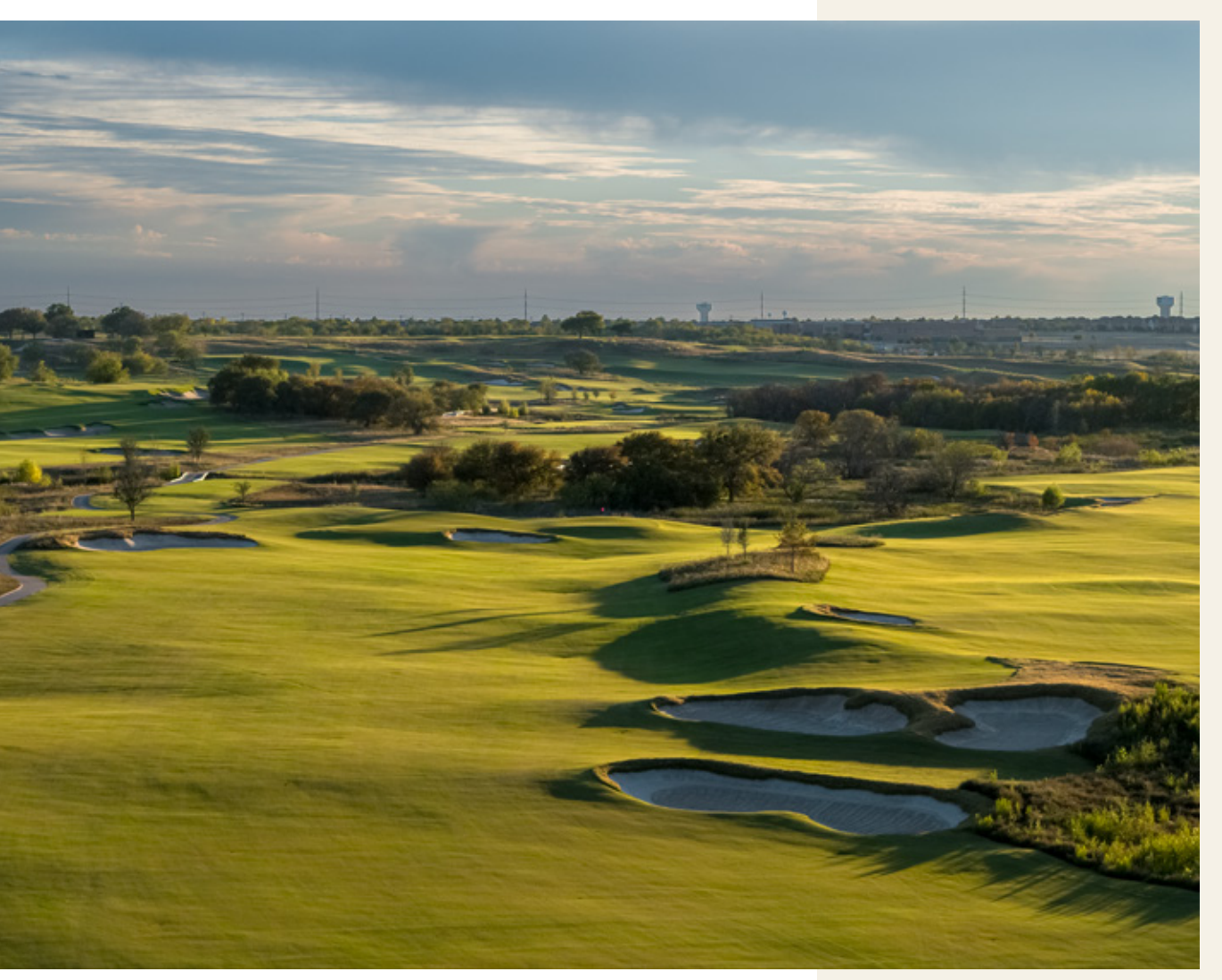
FIELDS RANCH WEST #1