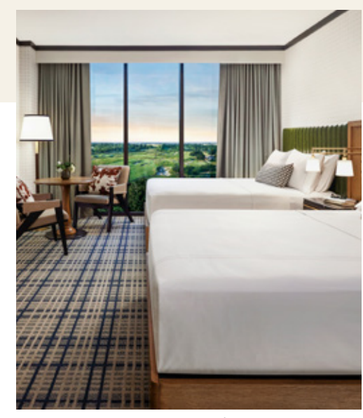
DELUXE DOUBLE QUEEN | 340 SQ. FT.