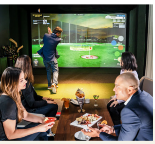
LOUNGE BY TOPGOLF