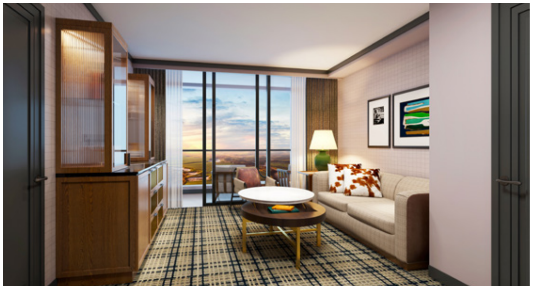
KING BEDROOM SUITE | 562-794 SQ. FT.