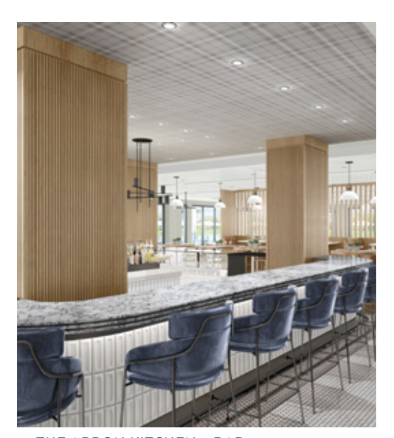
THE APRON KITCHEN + BAR