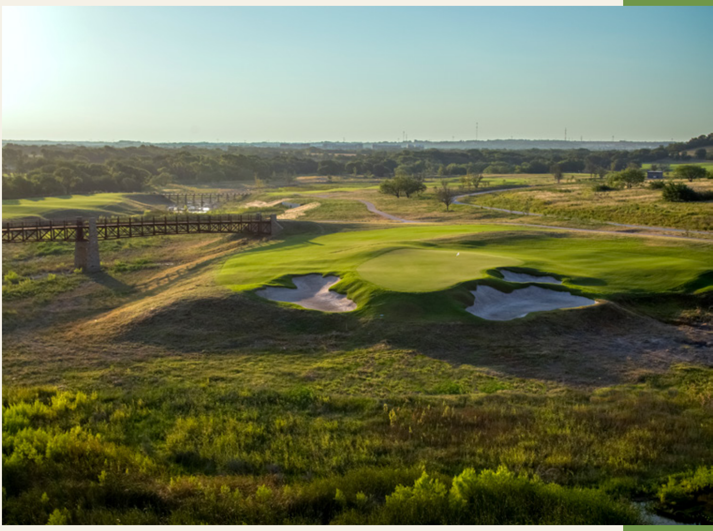
FIELDS RANCH EAST #8

In essence, Fields Ranch East provides strategic variety while incorporating the natural beauty of the property. The result is a championship-level course that will challenge and thrill golfers.