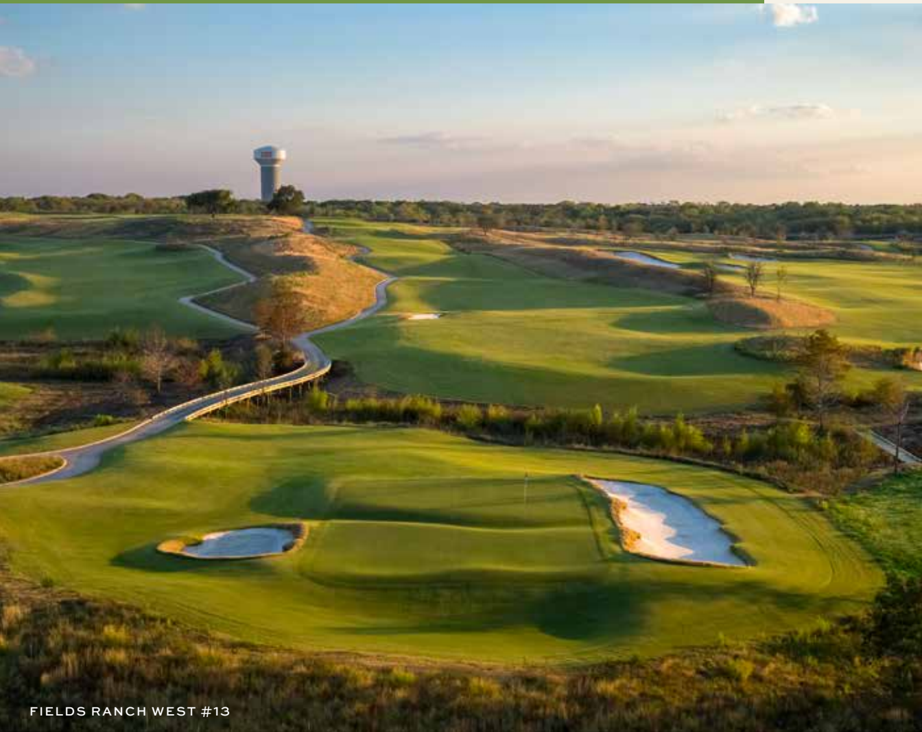
FIELDS RANCH WEST #13