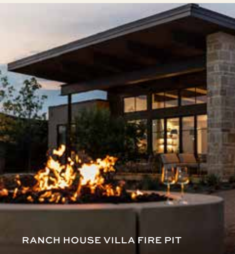
RANCH HOUSE VILLA FIRE PIT