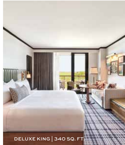
DELUXE KING | 340 SQ. FT.

Each of Omni PGA Frisco Resort's guest rooms and suites feature subtle nods to Texas culture. These accommodations also offer the ideal retreat in which to rest and marvel at the panoramic views of expansive fairways and lush landscape. Warm tartan patterns are featured on wall coverings and carpets of each thoughtfully designed guest room. Custom designed oak liquor cabinets invite you to enjoy a Ranch Water cocktail, the region's signature cocktail from the comfort of your resort room.