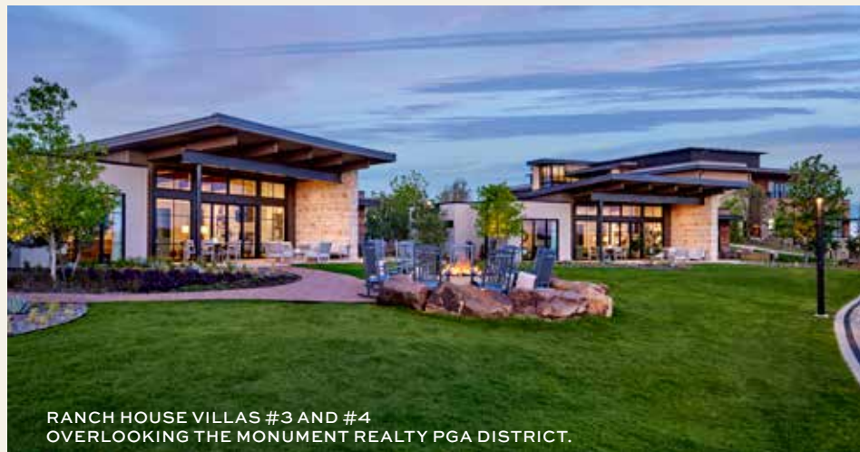
RANCH HOUSE VILLAS #3 AND #4 OVERLOOKING THE MONUMENT REALTY PGA DISTRICT.