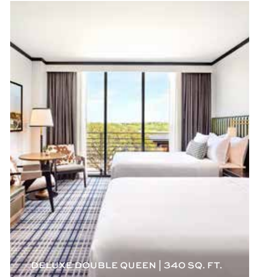
DELUXE DOUBLE QUEEN | 340 SQ. FT.