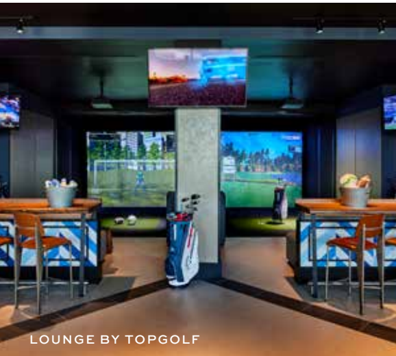
LOUNGE BY TOPGOLF