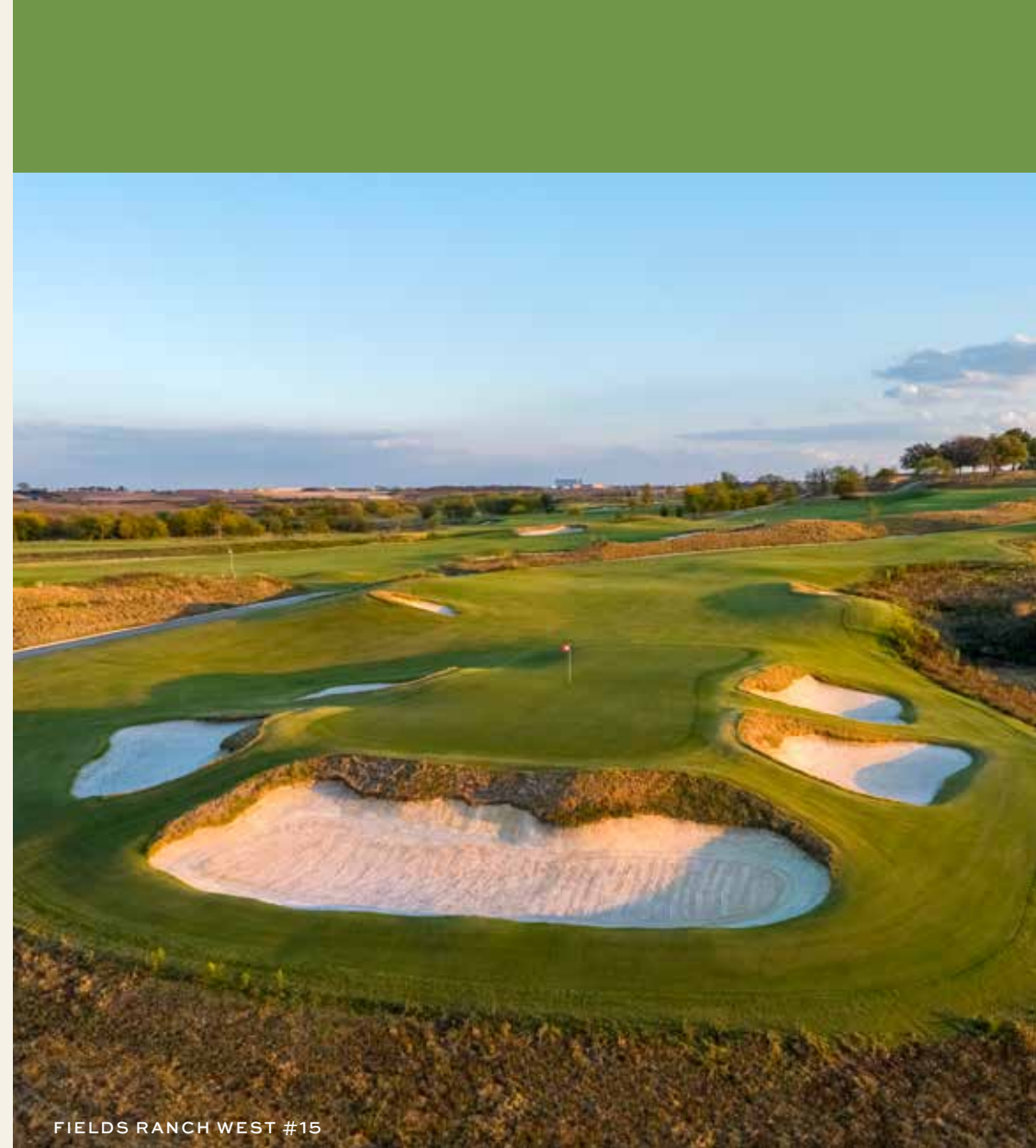
FIELDS RANCH WEST #15

Omni PGA Frisco Resort offers an abundance of amenities and activities that go beyond the surface. With two championship courses, 13 dining options, and evening adventures, this golf trip promises an unforgettable experience.