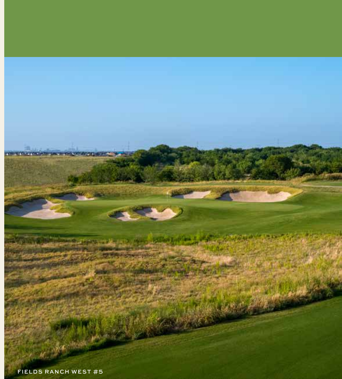
FIELDS RANCH WEST #5

Up next, play on the 2-acre Dance Floor — a putting green with two 18-hole courses to enjoy all afternoon. Cap off the day at Lounge by TopGolf, where five hitting bays equipped with Full Swing Technology and lively games await. And before tomorrow's round, take on the Fields Ranch East Course on the simulator as both championship courses are available to play.