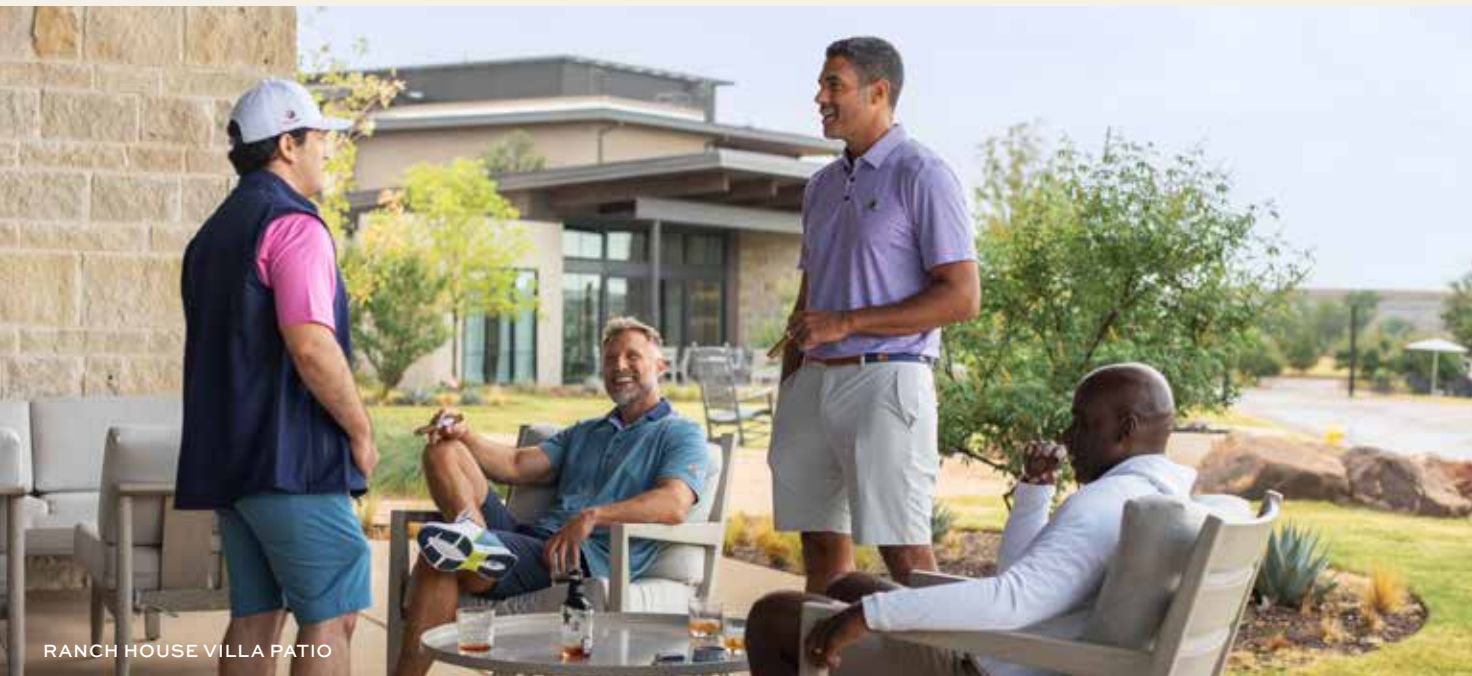
RANCH HOUSE VILLA PATIO