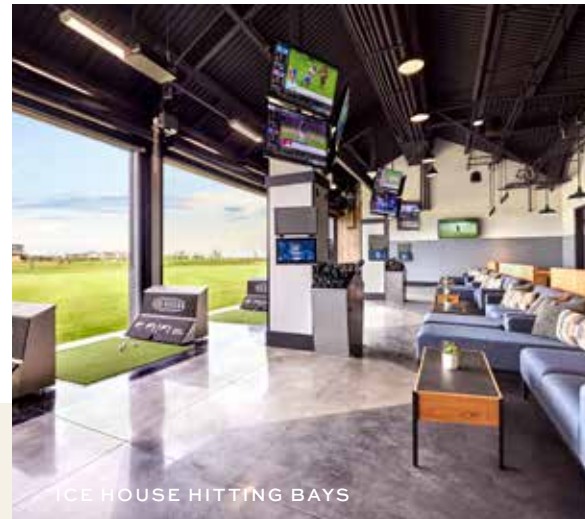
ICE HOUSE HITTING BAYS