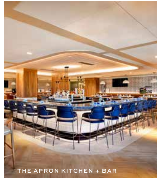
THE APRON KITCHEN + BAR