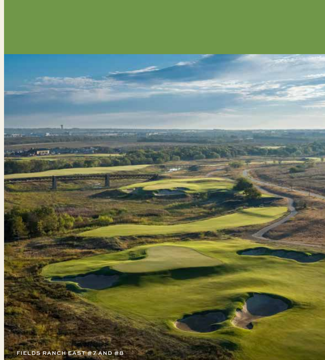
FIELDS RANCH EAST #7 AND #8

No one wants to rush from the airport to the tee box. Instead, take a breath, relax, get the group together and warm up. Our Ice House restaurant serves mouthwatering Texas barbecue, setting the stage for a golf adventure. Explore six hitting bays with Top Tracer technology, then head to The Swing — a 10-hole short course under starlit skies, ranging from 44 to 117 yards. An unforgettable golf journey begins here.