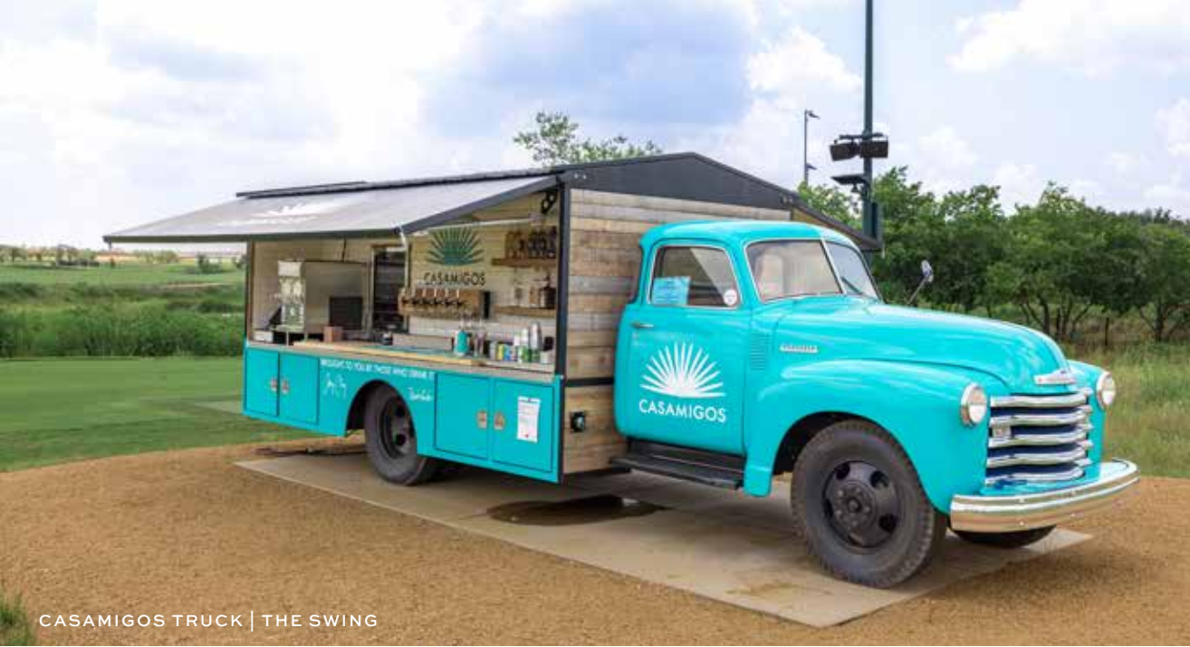
CASAMIGOS TRUCK | THE SWING