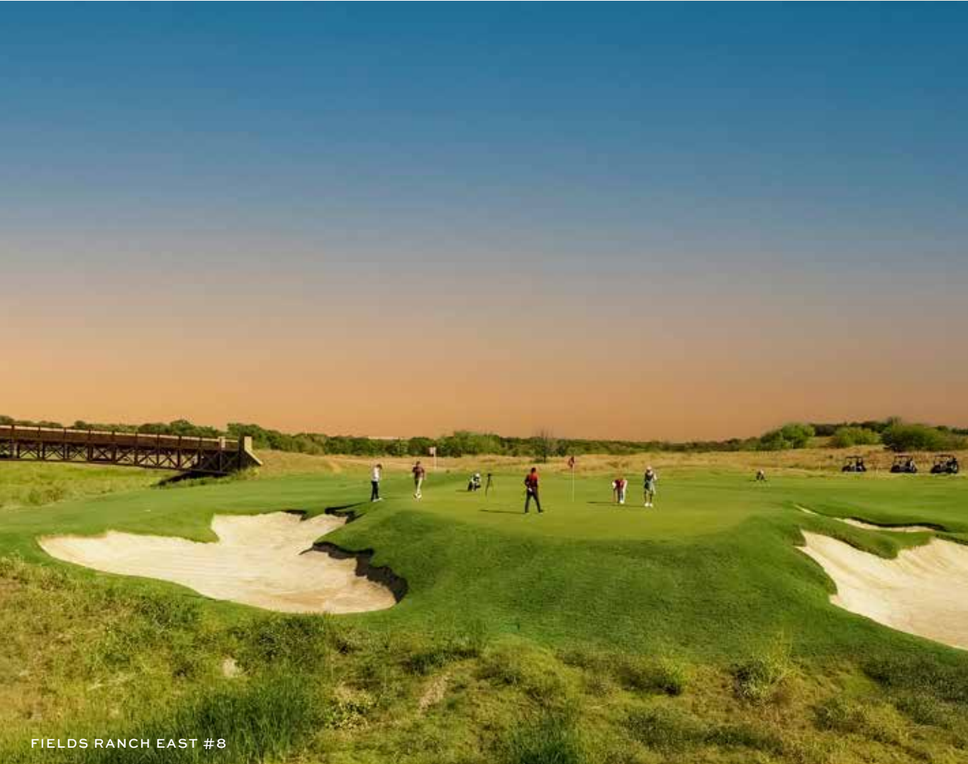
FIELDS RANCH EAST #8