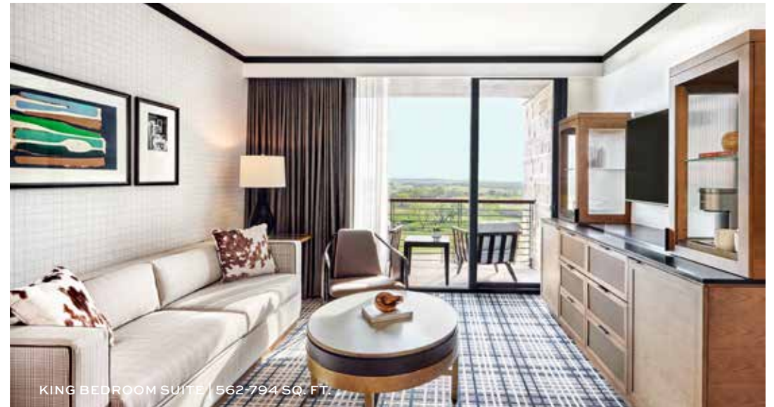
KING BEDROOM SUITE | 562-794 SQ. FT.